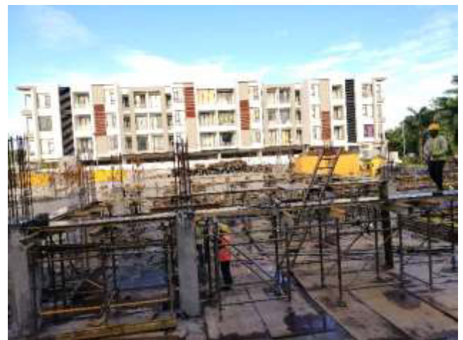
Photo 12: Shuttering to soffit of Ground B1 Floor Slab along GL E-G|1-5