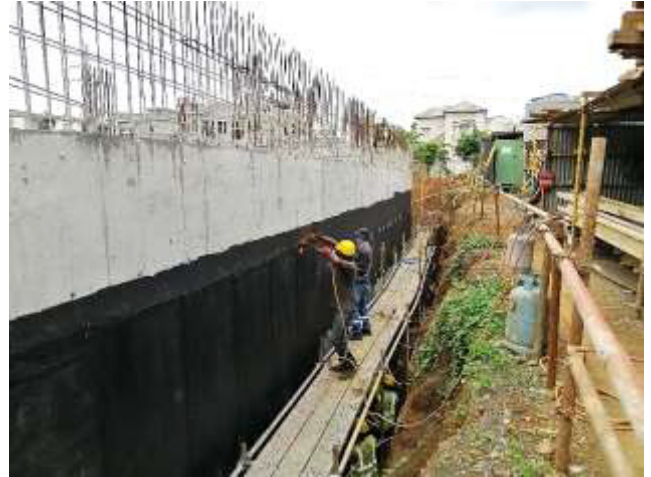
Photo 10: Laying of tanking membrane on retaining wall at GL D-J|7'