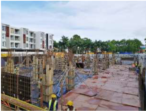
Photo 3: Shuttering to reinforcements of columns and protection to Basement B1 Floor slab along GL E-K|1-7