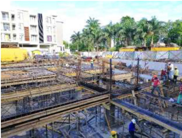
Photo 11: Shuttering to beam reinforcement of Basement B2 and installation of rainwater pipes along GL Ax-D'|1'-6