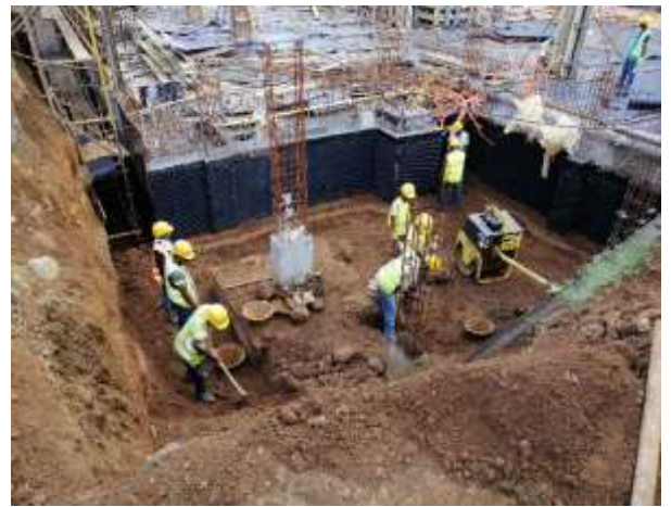
Photo 4: Backfilling and compaction around water tank area at GL J-Kx|4-7'