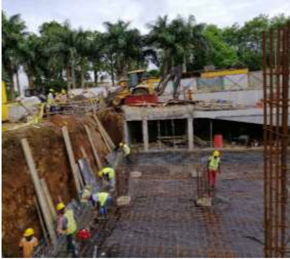
Photo 5: Reinforcement to floor of Basement B2 & drain along GL Ax-D|3'-7'